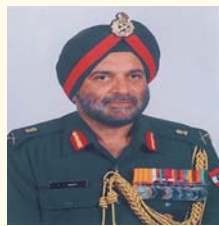
General J.J. Singh Chief of the Army Staff