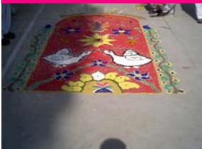
Rangoli Making Competition