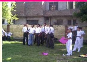
Kite Flying Competition