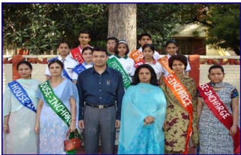
Investiture Ceremony of Houses