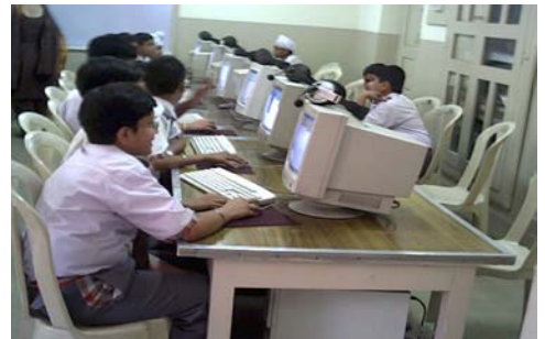
Students in the computer lab equipped with the latest technology