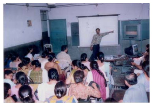
Teachers being oriented in the use of modern technologies in teaching