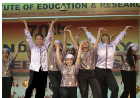
Students dancing to the beats of latest music on 70th Foundation Day