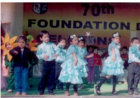
Tiny Tots of Humming Buds giving their first ever performance on stage