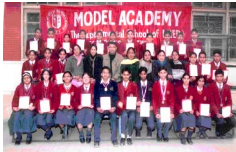
Winners of Talent Research Competition organised by United Schools Organisation at the National Level