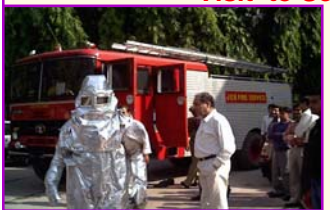
Demo by J&K Fire Services