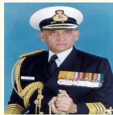
Admiral Arun Prakash Chief of the Naval Staff