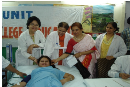
Volunteers donating blood at the Blood Donation Camp organised by the NSS unit of the college.