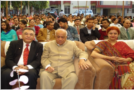
Pt. Mangat Ram Sharma, Minister for Health & Medical Education witnessing the Foundation Day function.