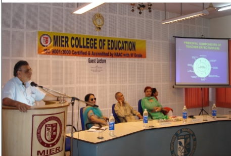
'How to become a successful teacher' Essential tips for teacher trainees.