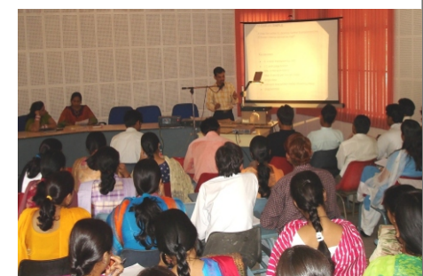
Teacher trainees attending a seminar on ICT usage in teaching-learning process.