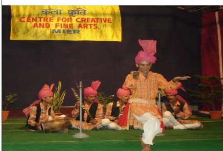
Folk artists performing at a function organised by Kalakriti.