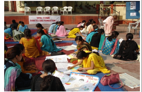
Students participating in a poster competition on World Diabetes Day.