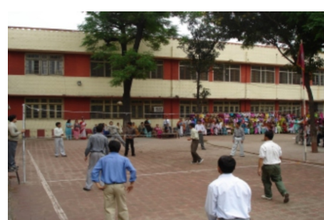
Students participating in an inter-section volley ball match.