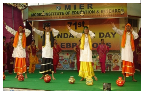
Students presenting bhangra on the Foundation Day.