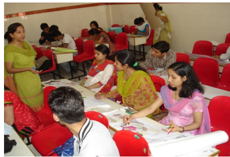
Workshop on preparing interactive teaching aids in progress.